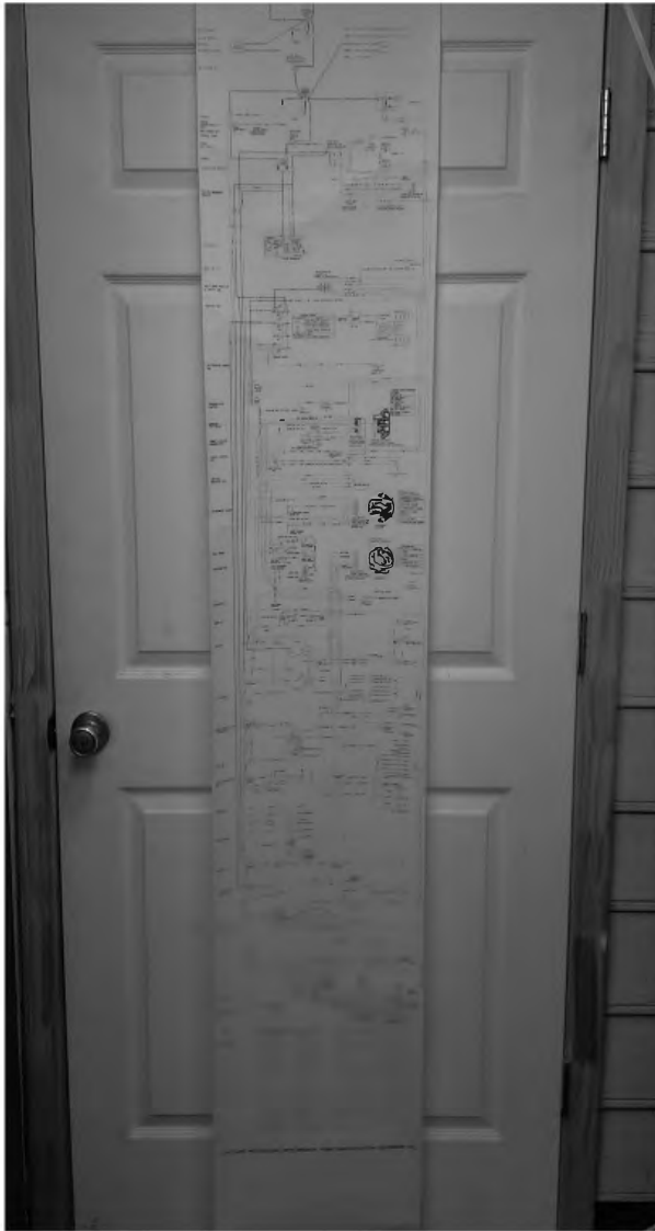
17" wide chassis